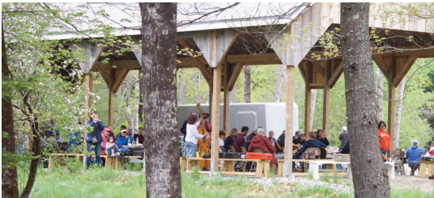
Wiscasset, Waterville, and Farmington Railway Museum's BMAM Jam & Meet Up.